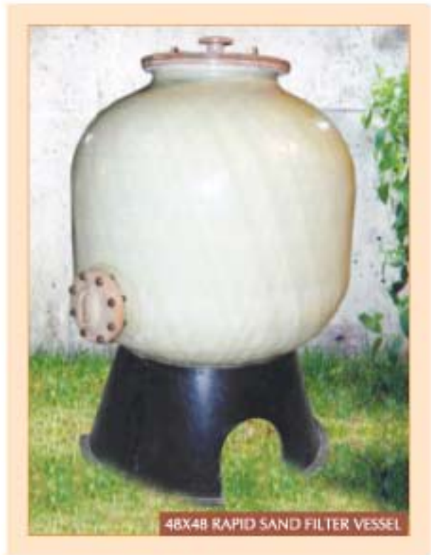
48X48 RAPID SAND FILTER VESSEL