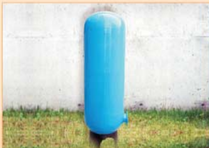
VESSEL WITH HAND HOLE