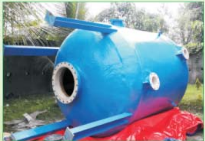
VESSEL WITH MANHOLE TOP & BOTTOM